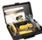
SamplerPak Kits Kits include motorized sampling pump, batteries and battery charger (if specified). See SamplerPak section for kit contents, accessories and spares; detector sold separately.