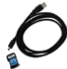
IR Connectivity Kit GA-USB1-IR Use for data download and instrument set-up options