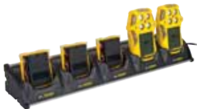
Multi-Unit Cradle Charger QT-C01-MC5 Simultaneously charge five detectors and/or batteries