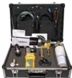
Confined Space Kit QT-XWHM-R-Y-NA-CS Order pump separately

Note: For complete list of Sampling & Testing Equipment, see the Sampling Equipment section.