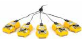
Multi-Unit Power Adaptor GA-PA-1-MC5-NA* Simultaneously charge five detectors and/or batteries