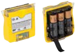
Rechargeable / Alkaline Battery Packs QT-BAT-R01 / QT-BAT-A01