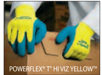
POWERFLEX® T° HI VIZ YELLOW™

APPLICATIONS: Cold Environment Work, Cold Storage, Winter Transportation, Unheated Warehouses, Yard & Field Work, Municipal Work, Public Utilities, General Maintenance, Offshore Applications, Cold Weather Construction